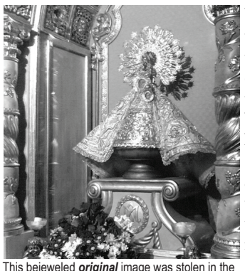
This bejeweled original image was stolen in the 1970's. Heavy rains poured unceasingly in Naga City. When recovered, the rains stopped. It was greatly damaged. The image is kept securely in a private chapel in the Basilica compound.

Father Miguel promptly had a chapel made of straw and other local materials erected in the site indicated by the cimmarones . This was around 1710. Father Miguel asked a local artisan to carve from local wood a statue of the Virgin Mary patterned after the stampita image of Our Lady of Peñafrancia that he had. It can be noted that the local rendering of the image